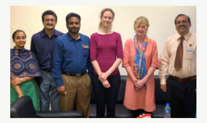
University of Groningen delegation at SOAHS